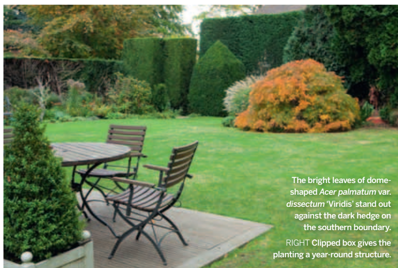
The bright leaves of dome-shaped Acer palmatum var. dissectum 'Viridis' stand out against the dark hedge on the southern boundary. RIGHT Clipped box gives the planting a year-round structure.