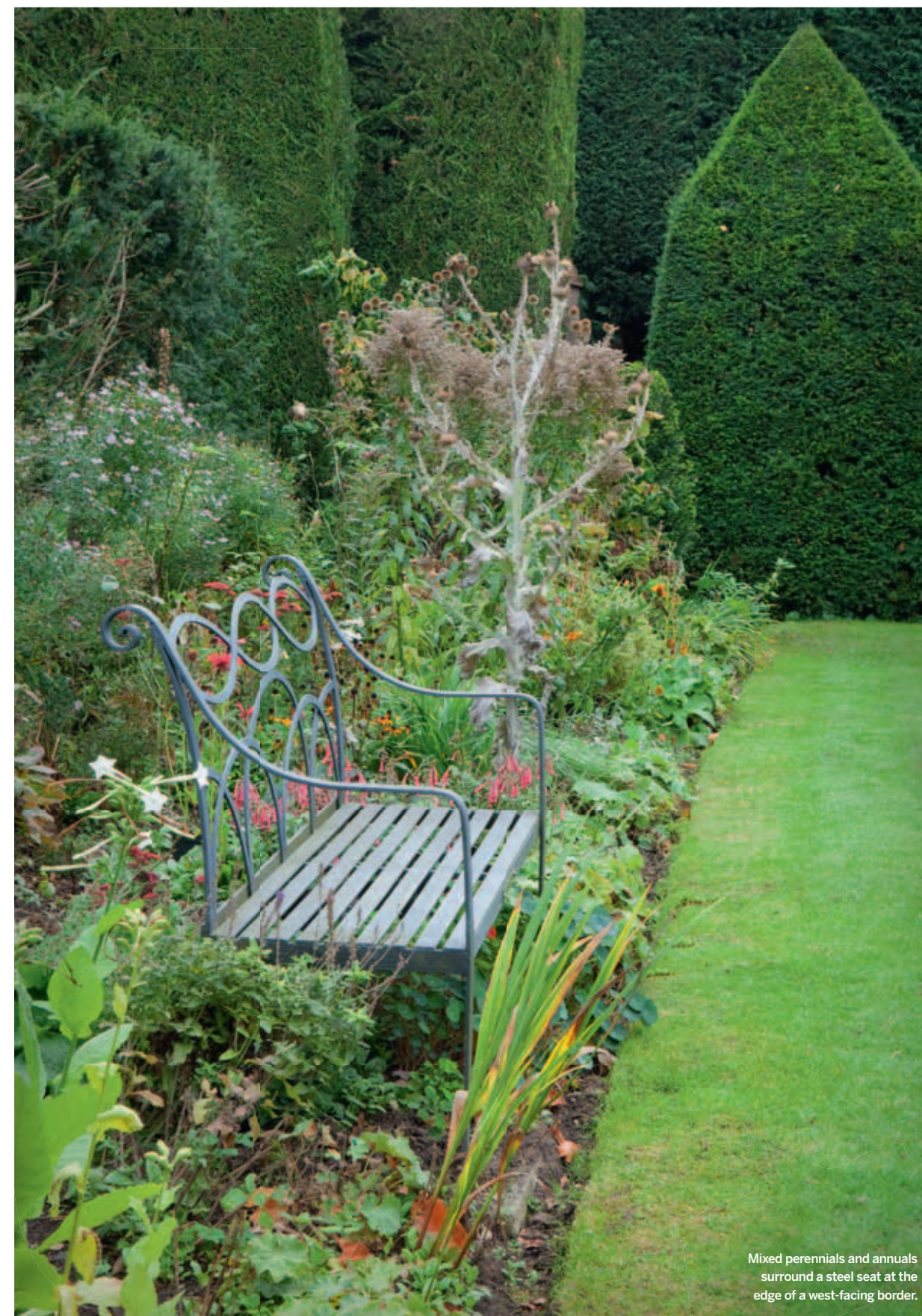
Mixed perennials and annuals surround a steel seat at the edge of a west-facing border.